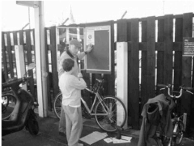
The Campaigns noticeboard being put up at the station by members of the Campaign.