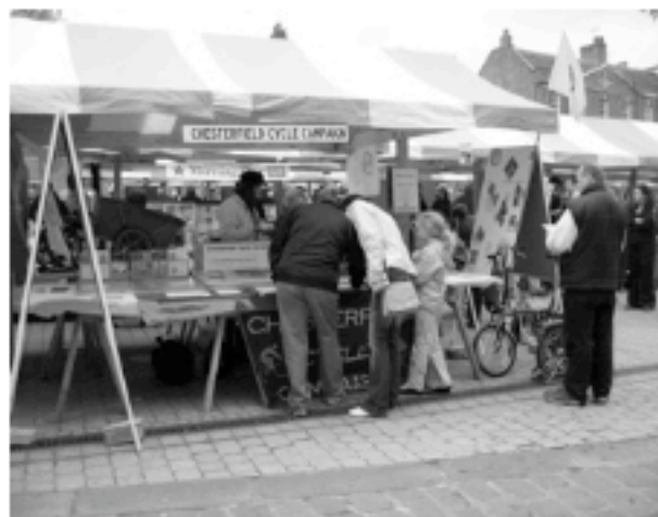
The Campaigns stall at the May Day celebration in Chesterfield