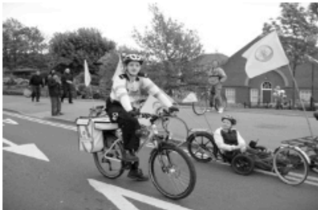
St Johns rapid response bicycle at the May Day parade