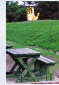
The Golden Hand is a specially commissioned piece of art as part of the Sustrans National Cycle Route.

Day tickets for fishing in Vicar Pond are available from the Water Bailiff.