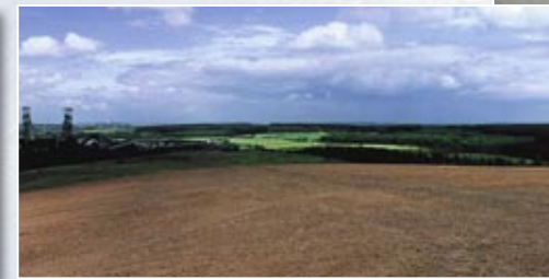
Spectacular views can be enjoyed from the top of the reclaimed spoil heaps.